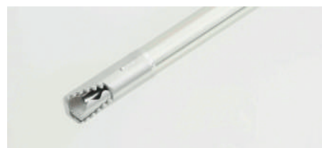
DR WAVE CUTTER® (one double blade)