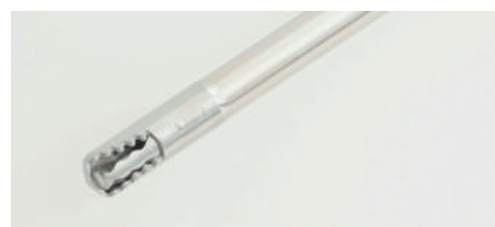
DR PIT BULL® (three double blades, large window)