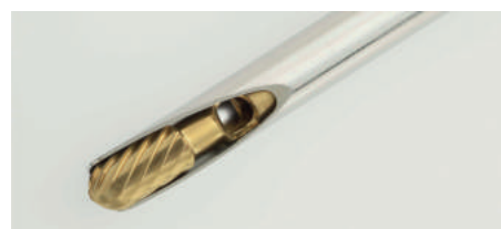
DR BARREL BUR®