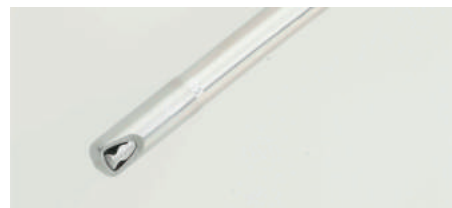
DR SYNOVIA PIT BULL® (three double blades, small window)